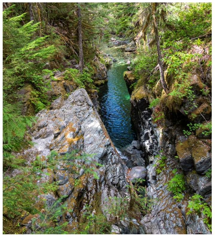
The Opal Creek hike in July rewarded RAPS participants with pristine views of the Oregon wilderness.