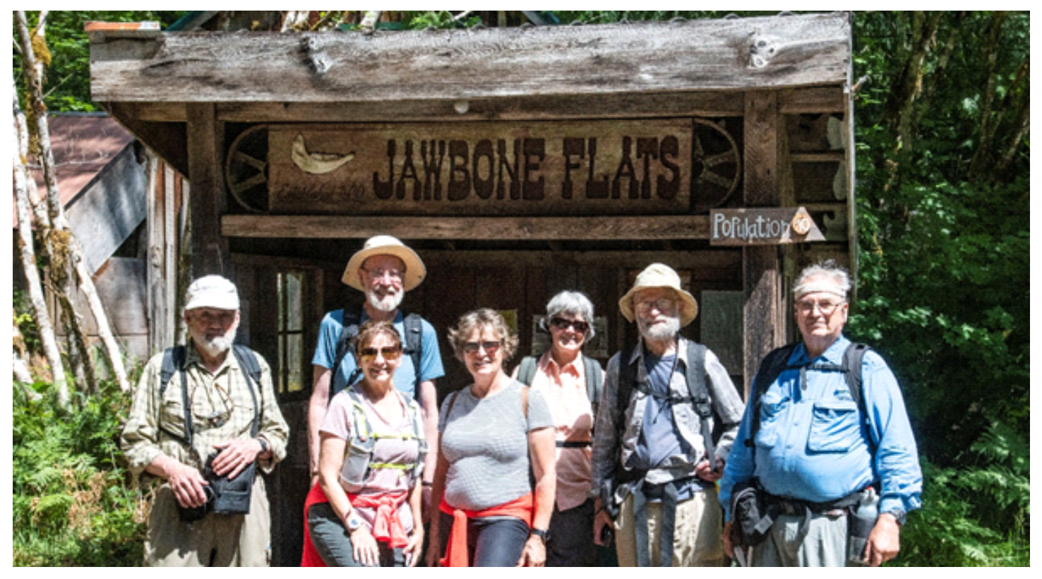
RAPS Hikers toured Jawbone Flats, a historic mining town in the Opal Creek area on July 23.