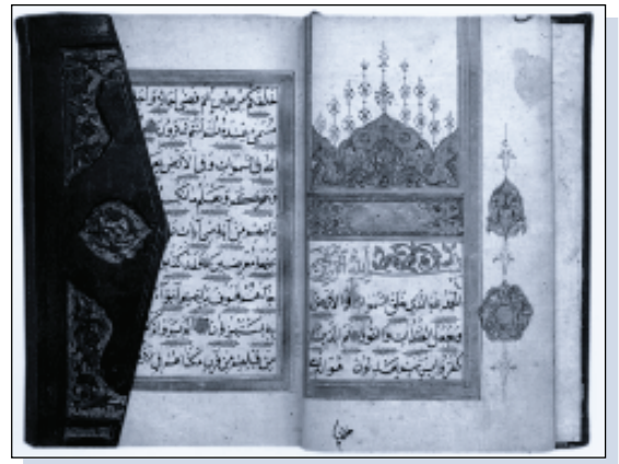
Ritual manuscript en Arabe Contenant Diverses Prieres et Surats du Coran from the Bibliotheque des Langues orientales.

Bibliotheque des Langues orientales. Extracted from Patrimoine des bibliotheques de France , Vol. 1, 1995. Banques CIC pour le livre, Fondation d'Enterprise, Ministere de la Culture et Payot, [Paris]