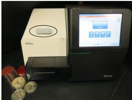
Figure 2. The MinION™ device (circled) sits atop the Illumina MiSeq sequencer. The MinION™ device is a nanopore sequencer that weighs less than 150 g, and occupies a volume of less than 100 cm 3 .

Advances in sequencing technology on Earth have been driven largely by needs for higher throughput and read accuracy. Although some reduction in size has been achieved, nearly all commercially available sequencers are not compatible with spaceflight due to size, power, and operational requirements. Exceptions are nanopore-based sequencers that measure changes in current caused by DNA passing through pores; these devices are inherently much smaller and require significantly less power than sequencers using other detection methods. Consequently, nanopore-based sequencers could be made flight-ready with only minimal modifications.