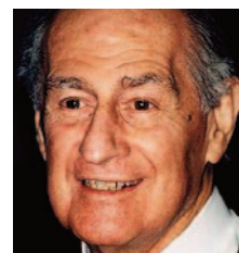
Gian Carlo Menotti