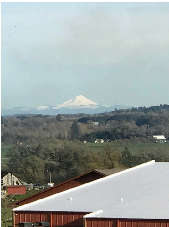
Mount Hood from the Willamina High School campus.

An EPA report found that infill development, as opposed to greenfield develop-