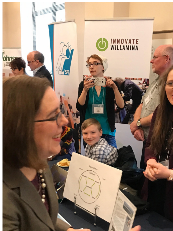
Governor Kate Brown visiting Willamina's delegation during Rural Oregon Day in Salem.