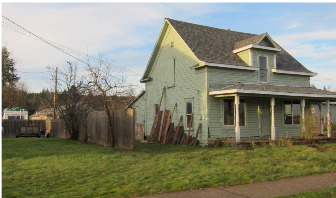
One of many vacant and dilapidated houses in Willamina.