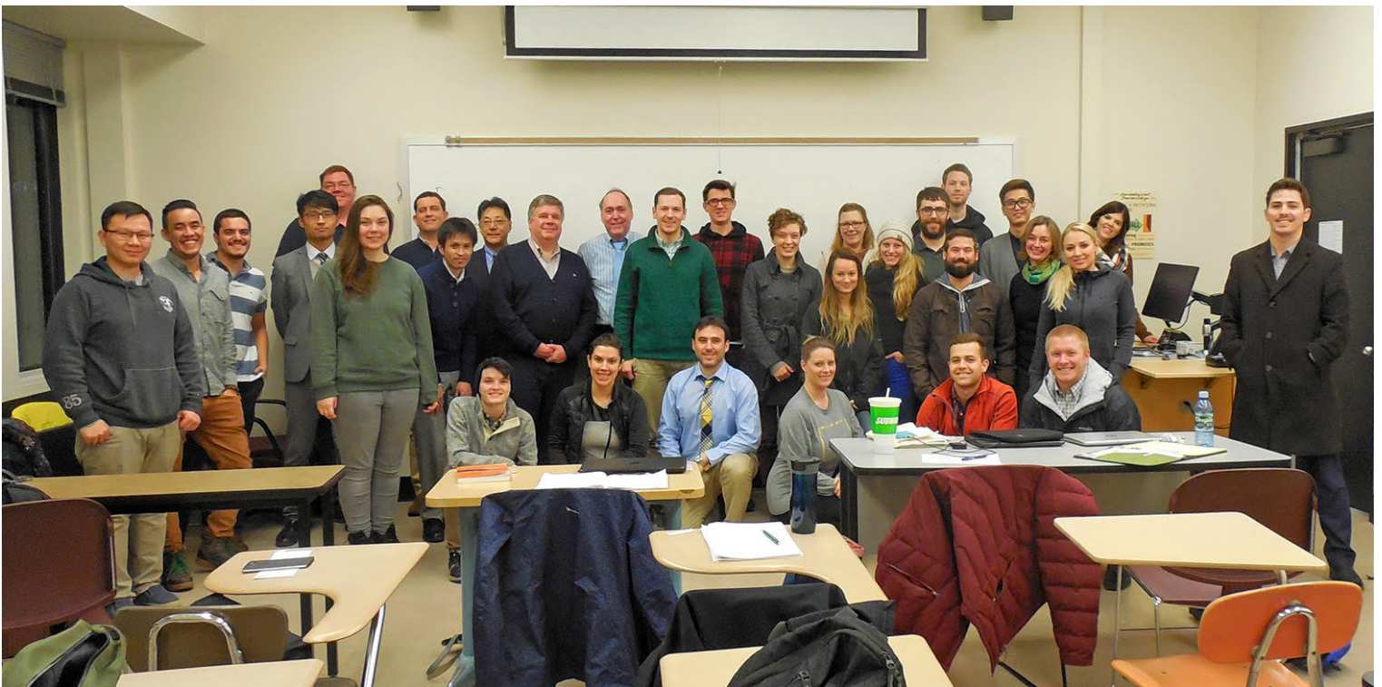
Ritsumeikan University and Willamina City Visit PSU.