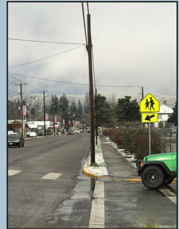
Main Street looking towards downtown Willamina.