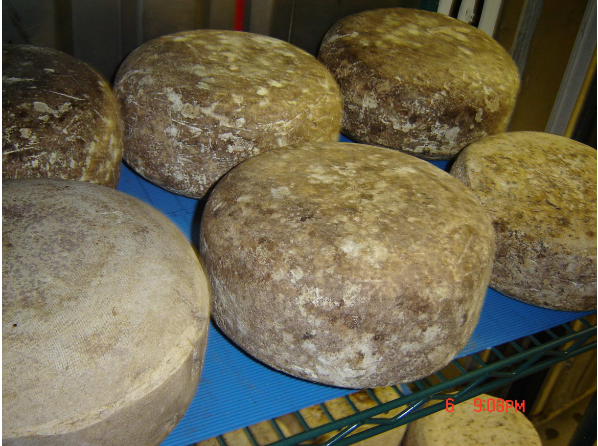
Test cheese. "Looks like bread!"