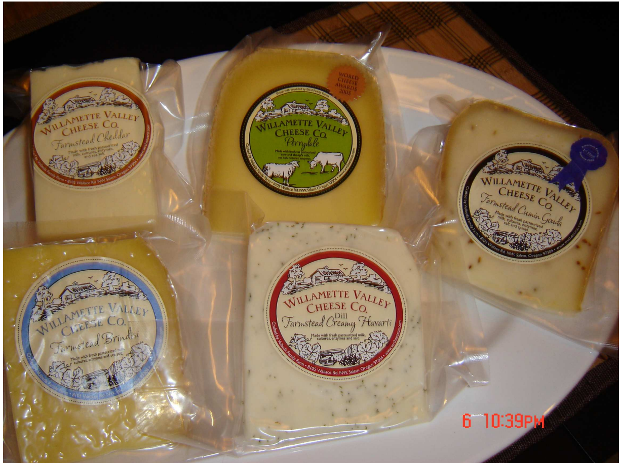
Award winning cheese