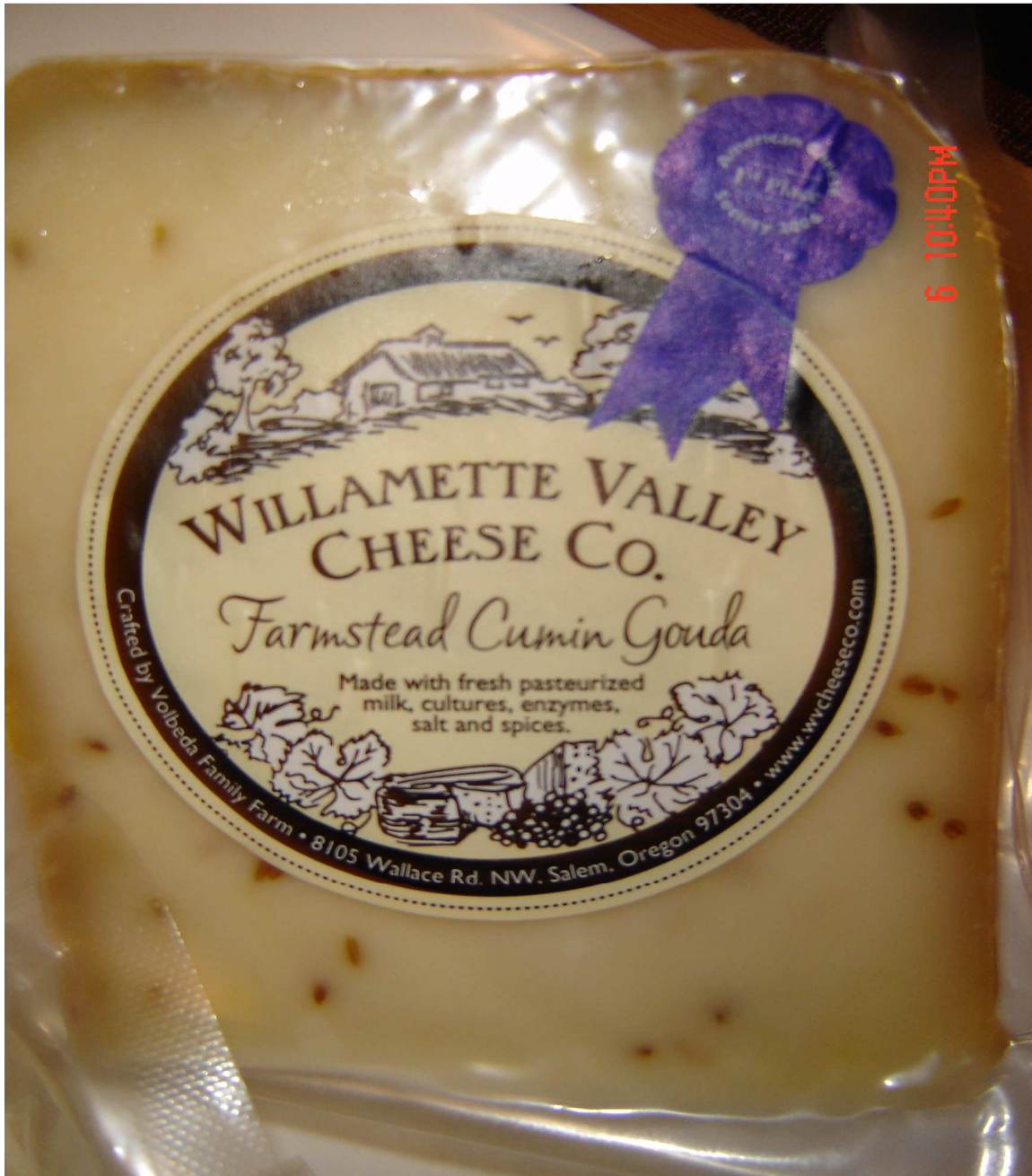
1st place cheese

Tour of the Willamette Valley Cheese Company , August 2007 (From the Sustainability History Project, Portland State University )