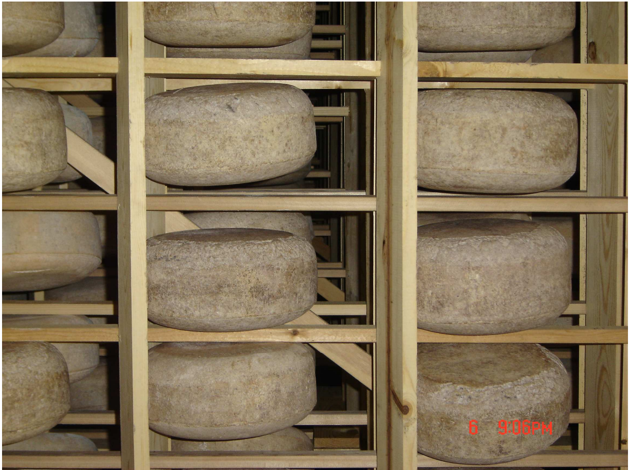
Hard rind cheese