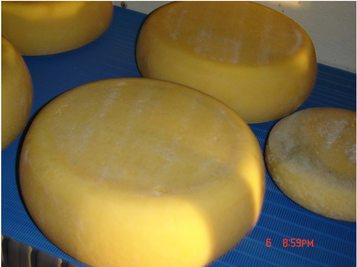
Raw milk Gouda-style