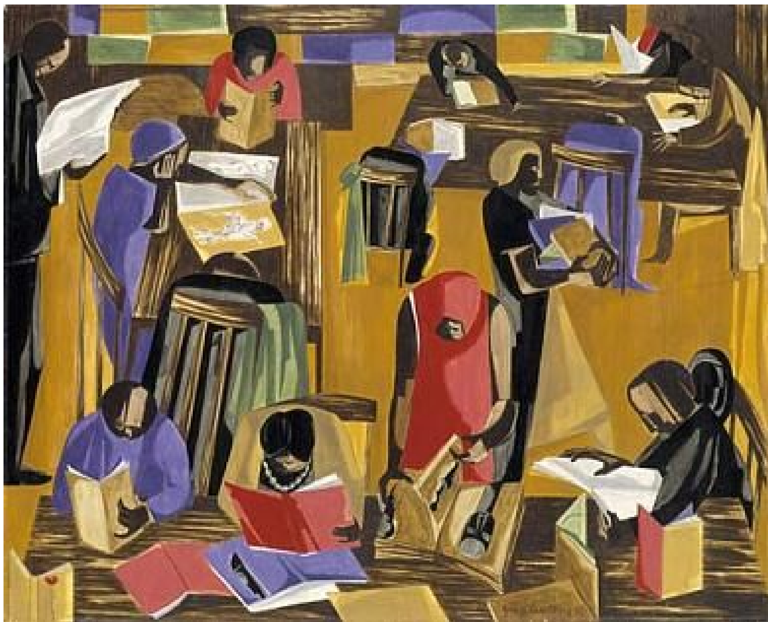
"The Library" Jacob Lawrence

http://americanart.si.edu/collections/search/artwork/?id=14376