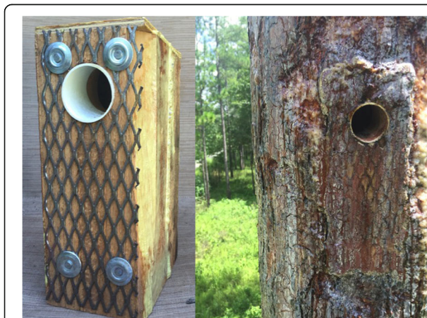
Fig. 1 Artificial insert boxes used in red-cockaded woodpecker population recovery in the Southeastern Coastal Plain in 2015. These boxes allow red-cockaded woodpeckers to nest in trees that are typically too young for natural cavities. Pictured here are boxes prior to (left) and after (right) installation.

Listed in 1973, the red-cockaded woodpecker ( Leucotopicus borealis Vieillot, hereafter RCW) was among the first species listed under the ESA. Population recovery efforts for the species include intensive, species-specific management actions like installing artificial nest cavities (Fig. 1). More broadly focused conservation efforts are directed at restoring fire-dependent longleaf pine ( Pinus palustris Mill.) ecosystems and the embedded RCW habitat (USFWS 2003). RCWs exclusively excavate and nest in live pine trees and, while they breed within a variety of pine ecosystem types across the southeastern US, RCWs show a preference for longleaf pine ecosystems with an open understory (Jackson 1994). Longleaf pine is a shade-intolerant species. Fire suppression leads to expansion of hardwood plant species, such as oaks ( Quercus L. spp.), that shade out longleaf pine seedlings and create an understory used by RCW nest predators. Maintaining an open condition (Fig. 2) in these systems requires surface