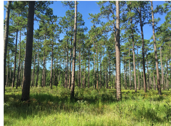
Fig. 2 Restored longleaf pine forest occupied by red-cockaded woodpeckers in northern Florida, United States, 2015.

fires every 1 to 5 yr. Historically, these fires were produced by spring and summer lightning strikes (Landers and Boyer 1999). Longleaf pine ecosystems, one of the most species-rich ecosystems in North America, once dominated the southeastern Coastal Plain, covering an estimated 94 million ha. Today these ecosystems occupy <5% of their original extent (Brockway et al. 2005; Jose et al. 2007).