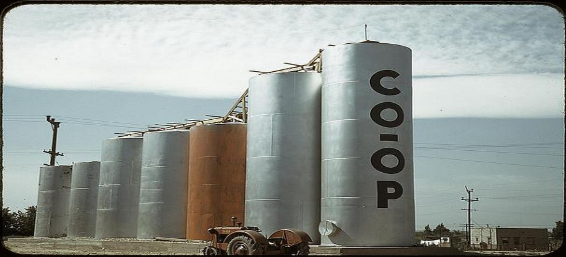
Grain elevators, Caldwell, Idaho