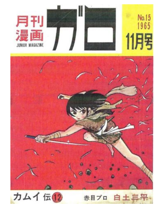
Shirato's cover art to Garo No. 15 (Nov. 1965).

In a Shirato ninja manga, you get a lot going on: there is an ensemble cast-style story that