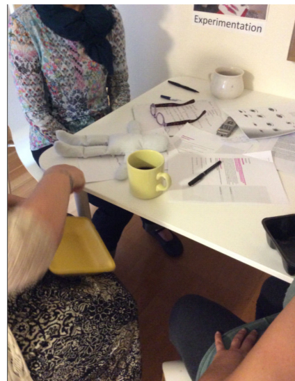
Figure 3. Laboratory CDC focus group.

The small focus group was given an identity planning chart to help make decisions and reach agreements about giving their persona doll a name, gender, age, race and ethnicity, favorite foods and activities, economic class, home, cultural background, spoken languages, religion or spirituality, and family structure. The group was prompted to develop stories about the doll based on a list of physical traits (see Figure 3).