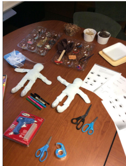
Figure 2. Reuse persona doll provocation.

The focus groups also had access to the multiple ateliers in the center, which were all filled with reuse materials that lend themselves to identity studies. There were organic snacks and drinking water available at a nearby table. Each small focus group was provided with a page listing a series of questions for the session.