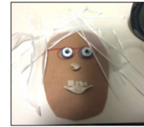
Figure 1. Lab CDC focus group director (left) classroom teacher (middle) studio teacher (right).