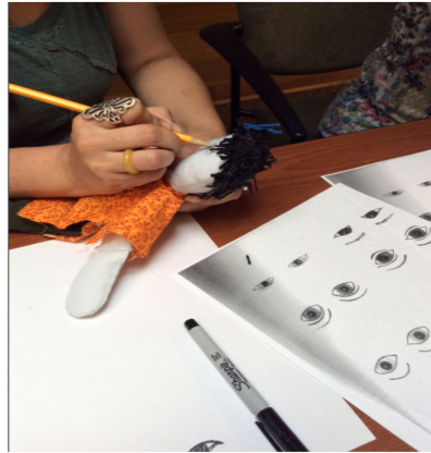
Figure 4. Physical characteristics are ascribed to the doll.

Disarray lives in a non-traditional family system where one household recycles and reuses, and the other does not. Since the focus group, these dolls have traveled to several schools, introducing themselves to classrooms of children and opening the community to their ways of living and experiencing the world around many topics, reuse materials education, gender identity, and many more.