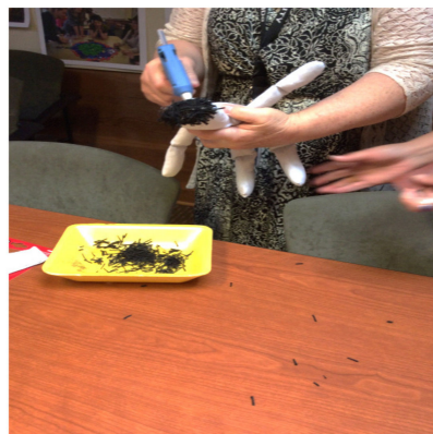
Figure 5. Spectrum of im/permanence.