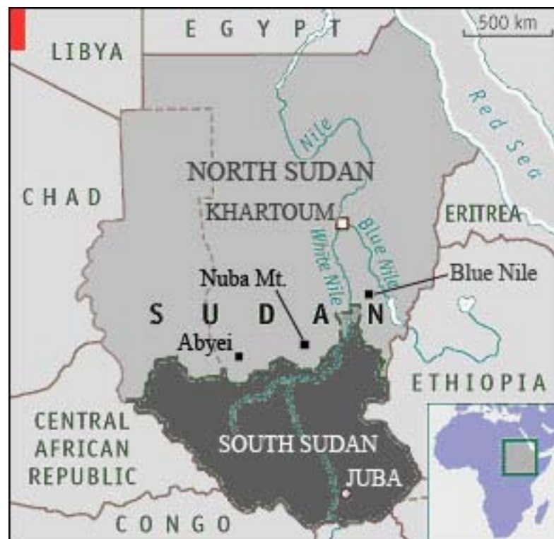
Figure 1 Map of the Sudan showing territorial areas of North and South Sudan

Sudan is geographically and socially diverse in language, race, religion, and location (Ronen, 1999). Sudan is an Arabic name meaning “the land of the black people” (Gall, 1998). This name was created by Arab traders when they took refuge in the country during an earlier migration. Prior to the Arab traders’ arrival, the land was inhabited by African Christians and animists. The Arabs took control of the land, changed names, and attempted to integrate African cultures with their own. This mentality initiated the conflicts between African Christians and animists and Arab Muslims.