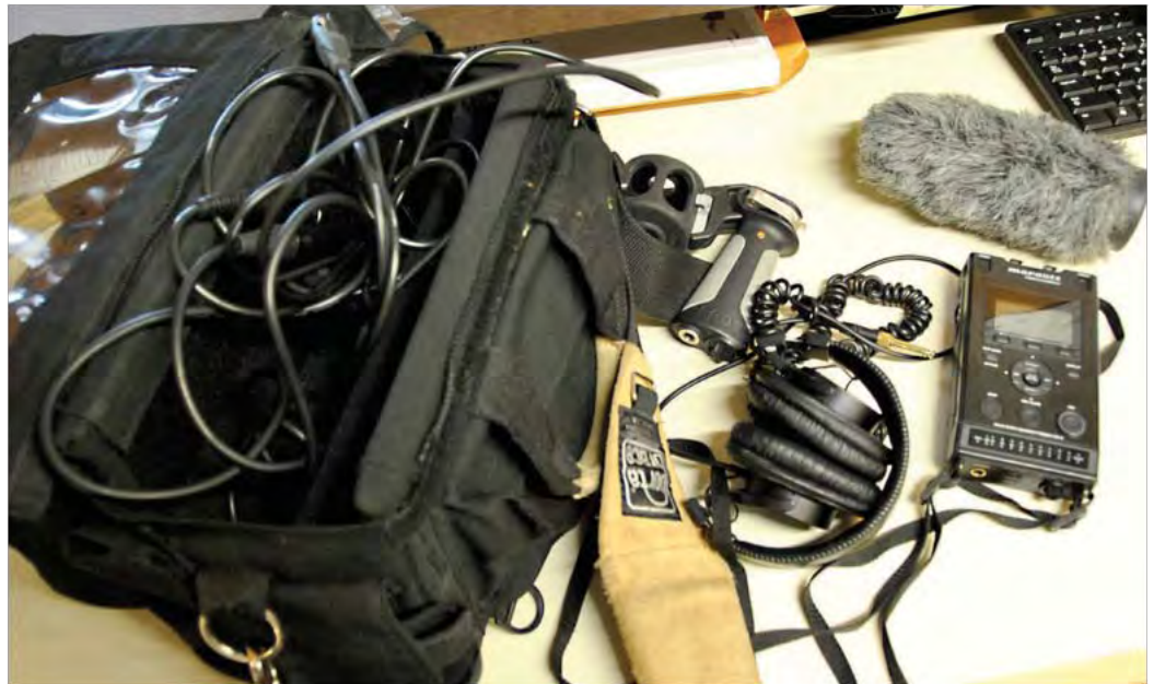
A typical UO Portland tech kit is very complicated and has many components which can be difficult to track or recognize as missing or damaged.

The limitations of our previous ILS made it difficult to create detailed item records which would allow Library student assistants to quickly verify if parts were missing or damaged based on how item inventory was configured within the system. Kits were often circulated without staff realizing that parts were missing or damaged, which created problems for MMJ students conducting off-site projects. Added complications arose when it came time to bill patrons for missing pieces, and all we had were the most basic of spreadsheets to log parts and accessories for re-ordering and follow-up. Comparing the inventory from the item record to the tagging system wasn't very streamlined, and our old tagging system wasn't always clear about the various components. Training students was often difficult because of all of the parts to track, which varied widely from kit-to-kit.