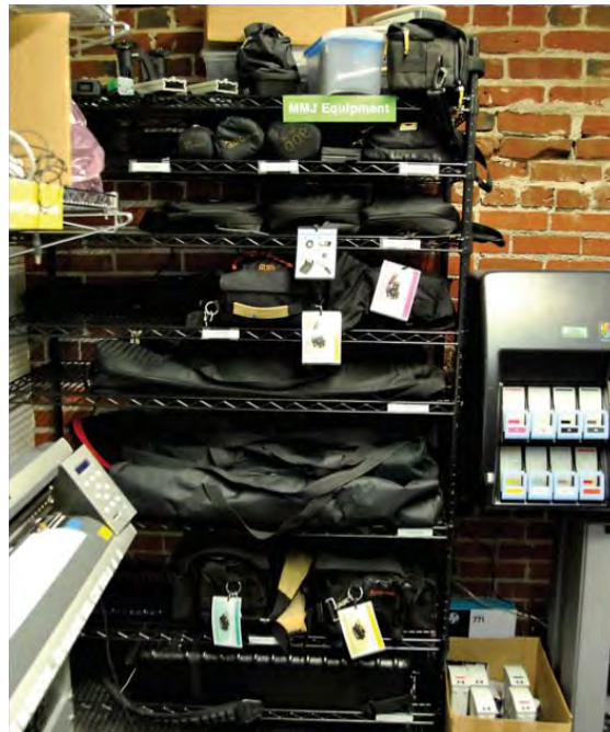
Equipment used to support the Multimedia Journalism (MMJ) program is housed in the UO Portland's Output Room.

equipment widely used in the journalism trade such as multimedia camera kits, digital recording equipment and tripods. The Library's supporting Output Room circulates this equipment to all qualifying MMJ students and acts as steward of the collection by housing, inventorying and circulating the kits to the Library's patrons. While the Library does not directly own this collection, we are accountable for maintaining and safely securing the items.