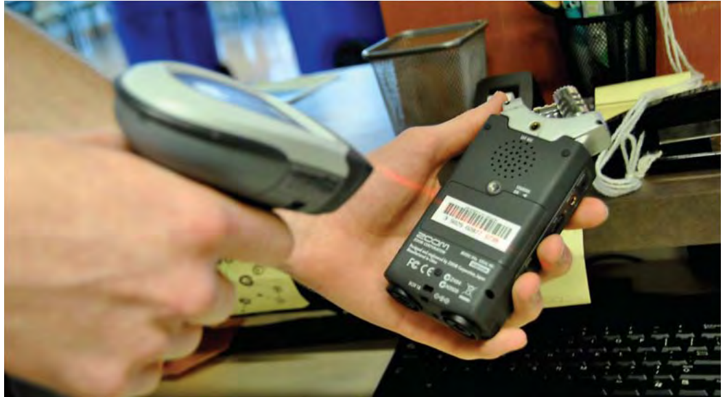
A UO Portland student checks out an item to a patron.

MOLLY: The PSU Library began our equipment lending program five years ago with a small number of laptops. We began lending laptops as a pilot program in the summer of 2011, starting with 20 laptops and allowing them to circulate for two hours at a time. By the end of September, we had feedback from students that the two-hour checkout was not long enough and extended the loan period to three hours. We have added 30 more laptops since the pilot program began. In addition to laptops, we began adding other equipment items to our enhance our lending program and now circulate a number of different items: headphones, phone chargers, adapters, pocket projectors, Bluetooth keyboards, iPads, and scientific calculators. All of these items check out for three hours at a time, and only students can check them out. Audio/Visual (A/V) Services are handled separately by the Office of Information Technologies. We chose items that made sense to check out as a library and were common requests from students.