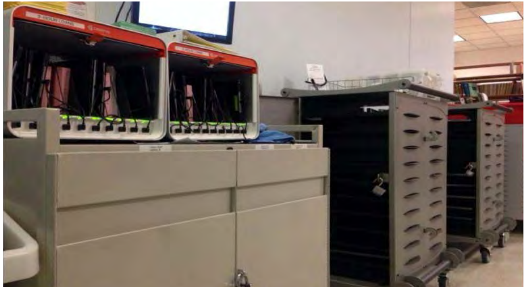
Equipment storage in Access Services at PSU.

equipment widely used in the journalism trade such as multimedia camera kits, digital recording equipment and tripods. The Library's supporting Output Room circulates this equipment to all qualifying MMJ students and acts as steward of the collection by housing, inventorying and circulating the kits to the Library's patrons. While the Library does not directly own this collection, we are accountable for maintaining and safely securing the items.