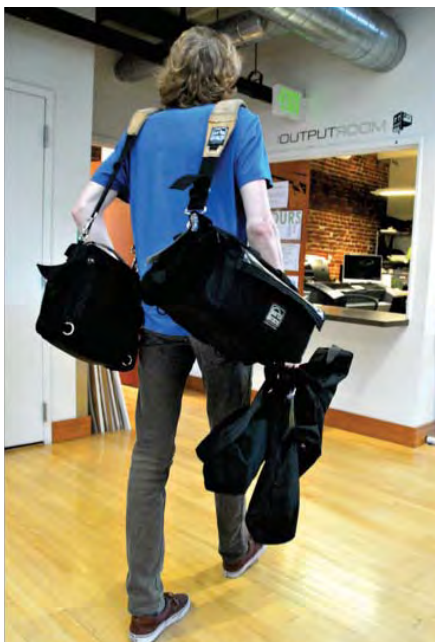
A UO Portland Multimedia Journalism (MMJ) student returns equipment to the Allied Arts and Architecture Portland Output Room service window.