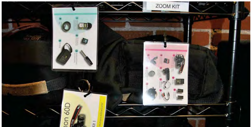
MMJ tags are color-coded and clearly labeled for ease of training. Photos are large to highlight the numerous components of a kit.

MOLLY: In the summer of 2014, we added an additional five laptops for students with accessibility issues, by partnering with the Disability Resource Center (DRC). Having these laptops available aligns with the mission of the DRC to remove student barriers to access in all aspects of their learning experience, and the library is pleased to be able to help support this service. The five computers are equipped with Job Access With Speech (JAWS), Dragon Naturally Speaking (speech-to-text) and Kurzweil 3000 (speech-to-text and literacy tools). Because the software requires a bit more training and support, we allow students to leave the library with the laptops in case they need to go to the DRC for assistance. The accessibility laptops do not circulate heavily but have a few dedicated users.