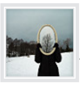
reflections (A)