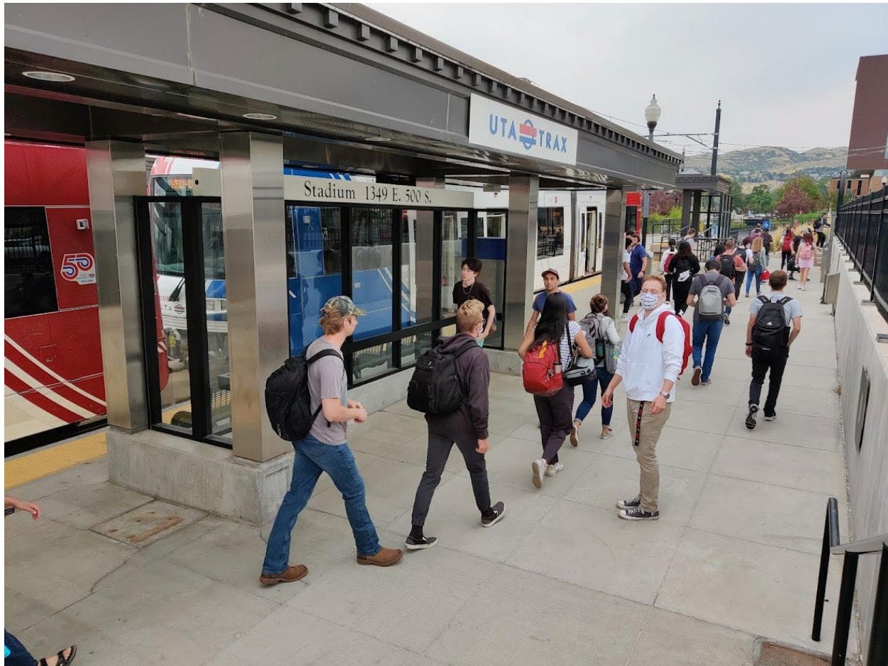
Figure 1: People at transit station with and without masks

Khan felt less safe in the captive environment of the train without the presence of the operator. However, transit employees' own behavior and enforcement of public health measures varied, and feelings of safety among riders shifted with enforcement. Salvador described a worrisome experience early in the pandemic when bus drivers were reluctant to wear face masks and were unsupportive of public health measures. Salvador went into detail: