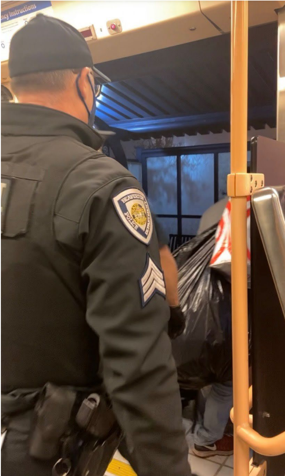
Figure 4: Police eject rider with bags of cans from train