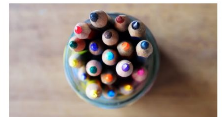
<u>Culturally Responsive Teaching</u>