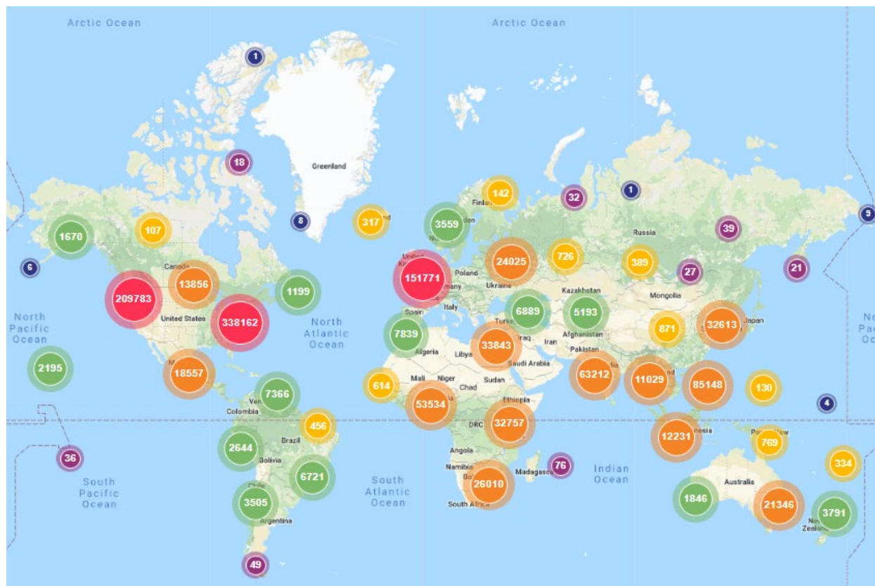
Figure 1. Map of the world representing downloads geographically.