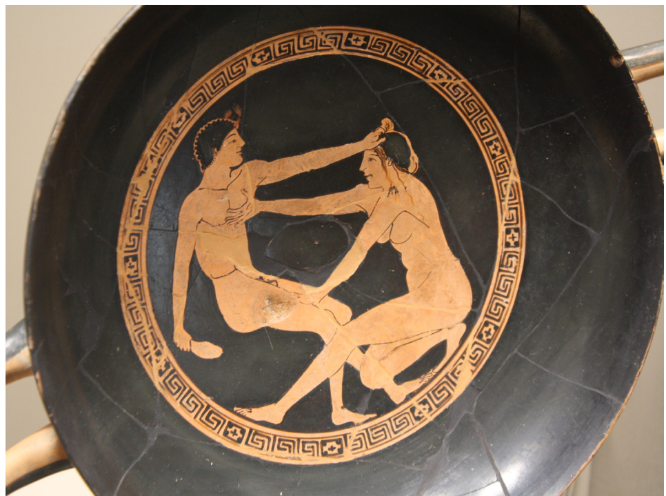
Figure 14. Kylix depicting Greek scene of eroticism and violence.