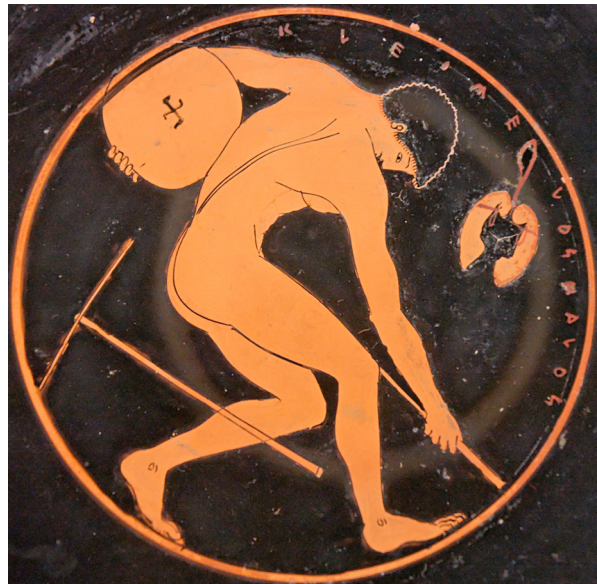
Figure 1. Kleomelos Painter, Discus Player.

Perhaps this admiration of the male body relates to male homosexuality, which was common and acceptable to the Greeks. Furthermore, the Olympic games were performed and watched entirely by men, while