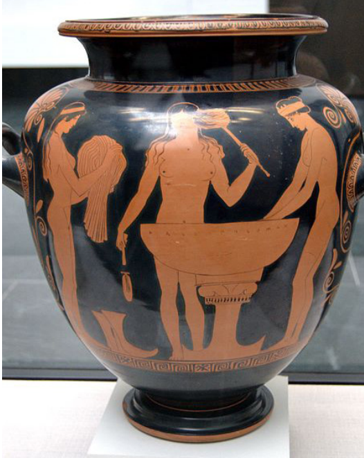
Figure 9. Three Women Bathing .

During the Hellenistic Period, Alexander the Great's conquests brought in "new ideologies and views," and this initiated transformations regarding the role of women