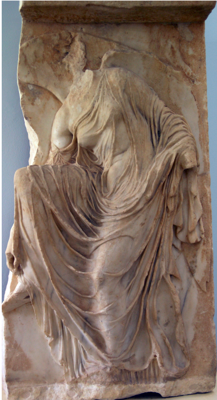
Figure 21. Nike Adjusting her Sandal.