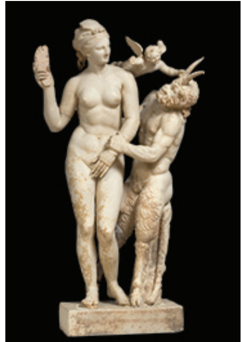
Figure 17. Aphrodite, Pan, and Eros.

During the Hellenistic period and the conquest of foreign lands, Greek culture was exposed to new ideas. As stated, the role of women began to change, and trade with the Near East during the fourth and third centuries BCE influenced artistic expression. 86 Art from Mesopotamia exaggerated the female breasts and pubis, either by enlarging these parts or by the gestures of the figure drawing attention to them with her hands (fig. 20). 87