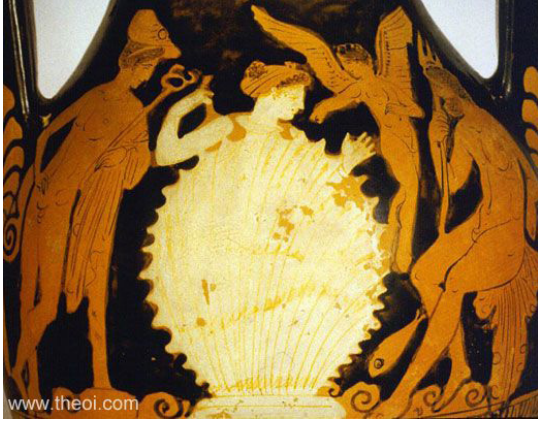
Fig. 15. The Birth of Aphrodite .

the goddess commonly took baths, which would have been renewing and purifying to her. 51 Her frequent bathing relates back to her divine birth at sea, and also explains her