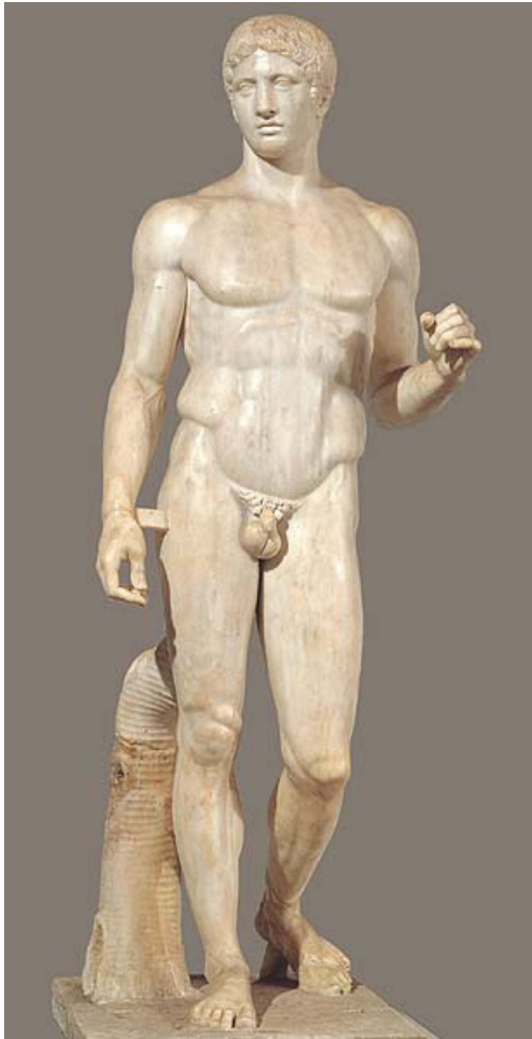
Figure 3. Doryphoros .