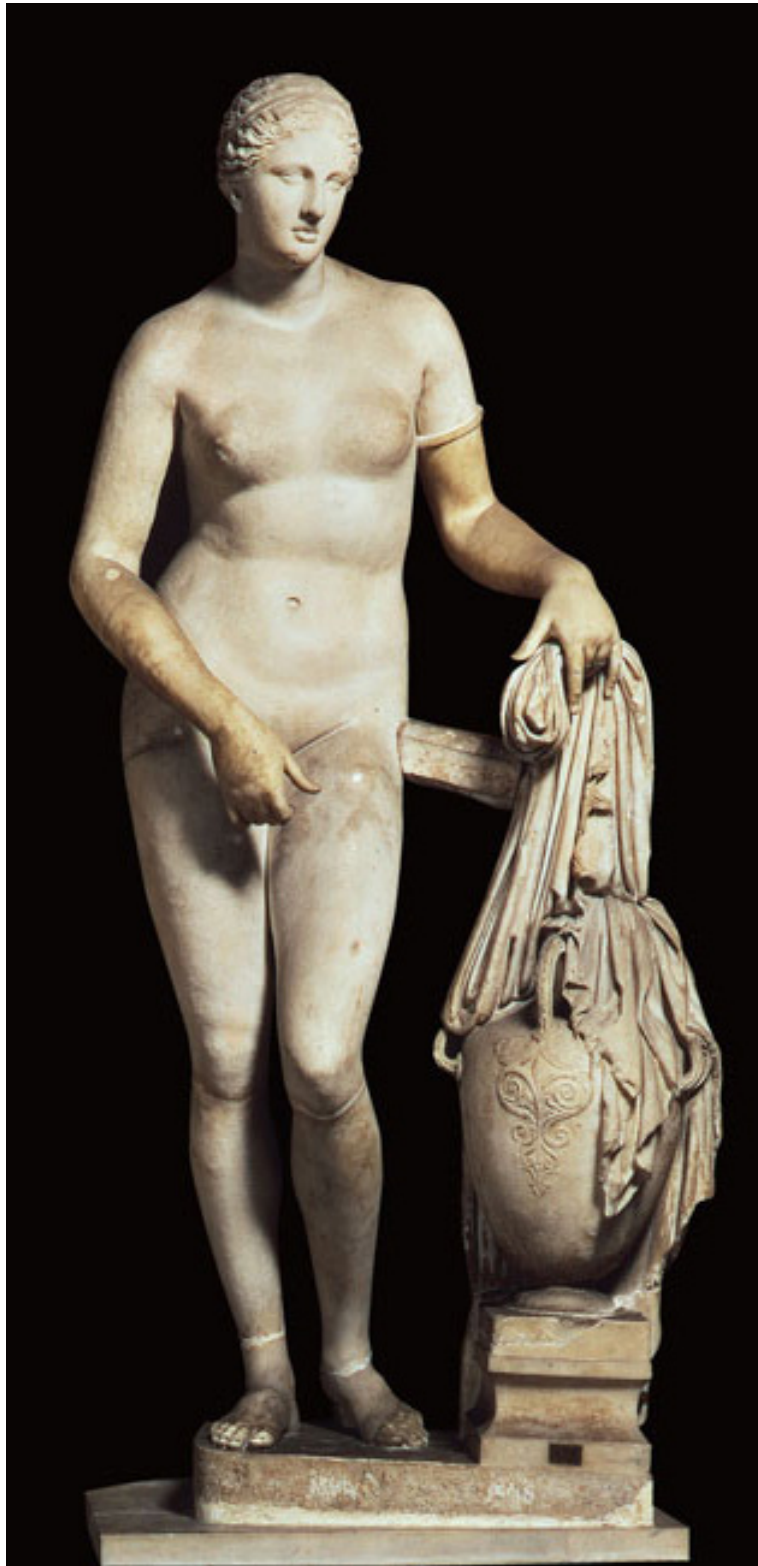
Figure 5. Aphrodite of Knidos (front view).