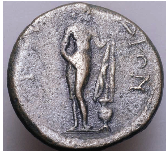
Figure 10. Roman coin depicting the Aphrodite of Knidos.

A majority of the copies agree that the Knidian was in a contrapposto stance, and that her head was facing to her left. 38 The details that remain unclear, however, include the degree to which her head was tilted, which hand she held over her pubis, how the arm that held the drapery was positioned, whether she was wearing any jewelry, and if she