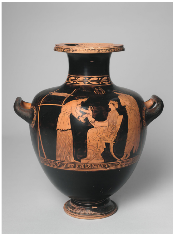
Figure 11. Hydria (water jar): Family Scene.

The town of Knidos, located in what is now Tekir, Turkey, was situated at the point of a thin peninsula (fig. 12), and Aphrodite's sanctuary was positioned on a hill that had a view of town and the sea. 43 A round temple, or tholos, is commonly associated with Aphrodite, and this could imply that the Knidian was housed in one. 44 Pliny's accounts support this idea as he writes about the statue in an open and round structure that enabled viewing from all sides. 45 A replica of the round temple was created by a Roman emperor to hold a copy of the Knidian, which also reinforces the idea that she was housed in a tholos. 46