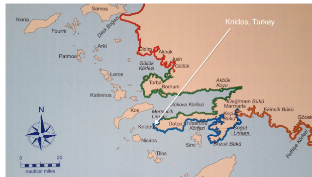
Figure 12. Knidos, Turkey.

Water had great significance in ancient Greece for its purifying qualities and for its representation of renewal. 50 Illustrated in the statue's pose next to the hydria,