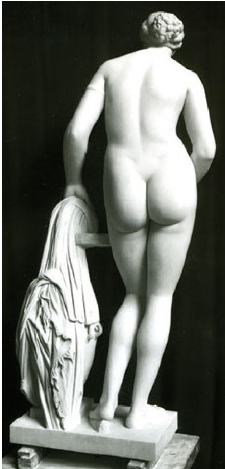
Figure 6. Aphrodite of Knidos (back view).