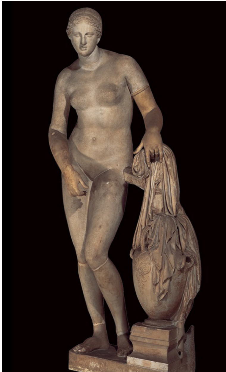
Figure 7. Aphrodite of Knidos (side view).