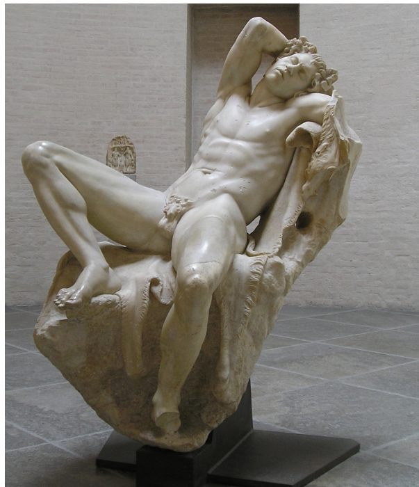
Figure 22. Barberini Faun .

Goddess of Love as his metaphor and muse to initiate the aforementioned dialogue between statue and viewer that is centered on a sensual topic. This statue opened doors for new works of art, wherein the role of women was recognized and celebrated. Indeed, Praxiteles was the first sculptor to brave the uncharted waters of portraying the nude female, which was a huge success. Her beauty, femininity, and sexuality no doubt created intrigue, shock, and drama. These combined elements worked together to inspire future artists to celebrate the female nude. This new trend broke down the barrier and allowed women to be depicted in the nude, removing the status of “low-lives” like prostitutes or victims. Aphrodite, the Goddess of Love, encourages the viewer to enjoy her nudity while inviting us to voyeuristic pleasures! The Aphrodite of Knidos, on any level, acts as a trendsetter in her shedding of drapery and thus earlier established traditions.