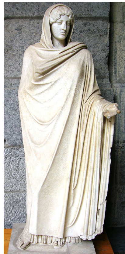
Figure 4. Aphrodite Sosandra .

Oddly, considering that she was a goddess who embodied love, sexuality, beauty, and femininity, Aphrodite had never been depicted nude in ancient Greek art prior to the mid-fourth century BCE. The Aphrodite Sosandra provides a great example of the clothed goddess (fig. 4). In this sculpture, Aphrodite is covered head to foot with only her face, hand, and parts of her feet showing. This depiction of the Goddess of Love shows no hint of embracing her femininity or sexuality. This all changed when, between 360-330 BCE, Praxiteles created the now-famous statue known as the Aphrodite of Knidos (figs. 5, 6, and 7).