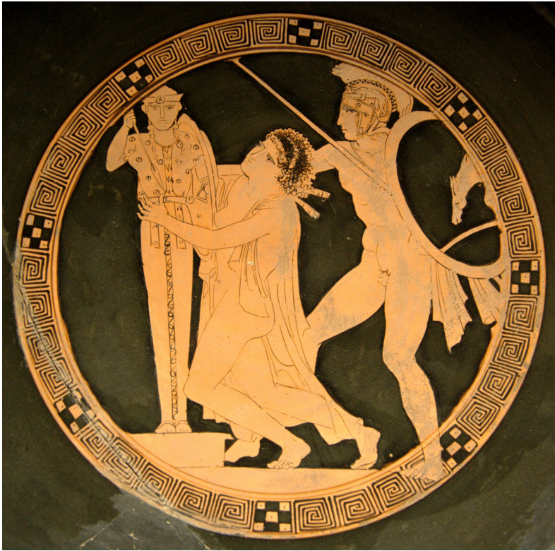
Figure 13. Kylix depicting Ajax the Lesser Raping Cassandra.