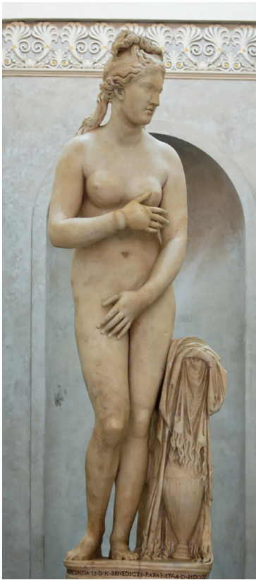
Figure 18. Capitoline Aphrodite .

Statuary of women directed the viewer's gaze to the body's most sexual aspects, and emphasized eroticism in the female form. Although the Knidian may not be as overtly sexual as a statue from the Near East, she most certainly directs the viewer's gaze by her elegantly and conveniently placed hand. This "eye-leading" approach is seen in the later works of the Capitoline and Medici Aphrodites, which likely simulate the Near Eastern approach more than the statue by Praxiteles.