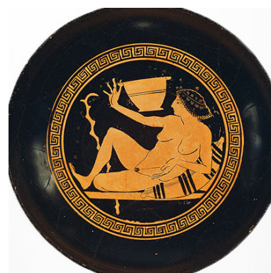
Figure 8. Woman Playing a Game

Pottery also became a popular gift not only for women, but for the bride and groom at a wedding celebration. The couple would frequently receive gifts of various types of pottery that depicted images of a sexual nature. 18 Depictions of ancient Greek art and mythological scenes on pottery often represented sexuality and fertility, 19 which could be seen as a means of the giver expressing well-wishes to the couple in their efforts to reproduce.