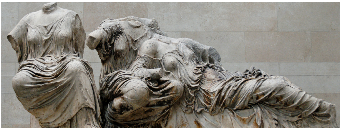
Figure 16. Hestia, Dione, and Aphrodite , from Parthenon East Pediment.

Earlier in sculpture, the female form was depicted according to norms established by the societal role of women. At the end of the fifth century BCE, a new style of sculpture was born that gives the apparent look of a wet garment. This new style allowed the female form to be seen underneath the drapery, as if her clothing was wet and clinging to her (fig. 16), 58 earning it the name "wet drapery style." Sculptors thus showed the sensuality and sexuality of the female form without breaking restrictions of showing the naked female body. The so-called "wet drapery style" was a vital precursor to Praxiteles depicting Aphrodite in the nude, and I speculate that it was a time where artists were exploring and embracing the idea of showing the female form more sensuously.