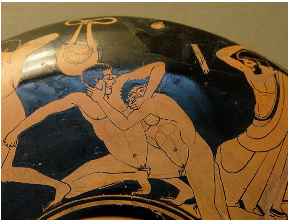
Figure 2. Foundry Painter, Pankration Foul (kylix).

With the belief that women were created secondary to men, Greek society was indeed restrictive toward women. Greeks were especially appalled by female bodily functions, such as childbirth, nursing, and menstruation, and it was considered taboo for men to touch women during these times. 3 Premarital sex was restricted to prostitutes or women of low class. For a woman outside of these low social classes, extreme consequences could ensue if she had sex before marriage, including slavery or