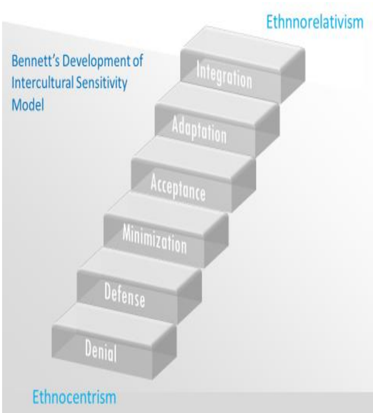
Figure 1 adapted from Bennett (1993)

more than one culture available to choose from. When making meaning of a situation they are likely to view each cultural perspective as equally suitable.