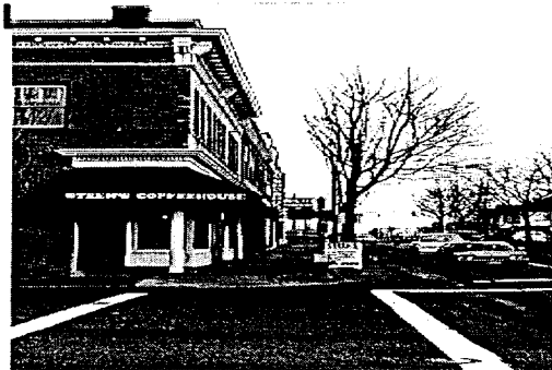
Urban area with many sources of air toxics

scientifically assess air toxics problems, reduce potentially high pollutant levels in urban areas or hot spots, and resolve known health risks from air toxics statewide.