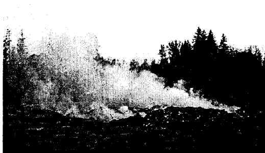
Burning household waste.

Air Quality Division 811 SW 6 th Avenue Portland, OR 97204 Phone: (503) 229-5696 (800) 452-4011 Fax: (503) 229-5850 Contact: Sarah Armitage www.deq.state.or.us