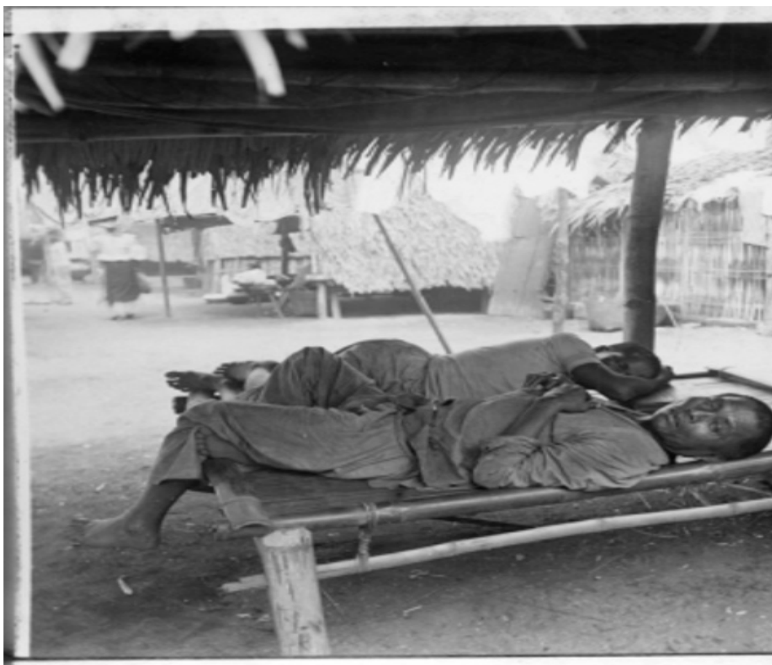
Figure 6. Sweet Repose, How the Filipinos Sleep (1898–1930).