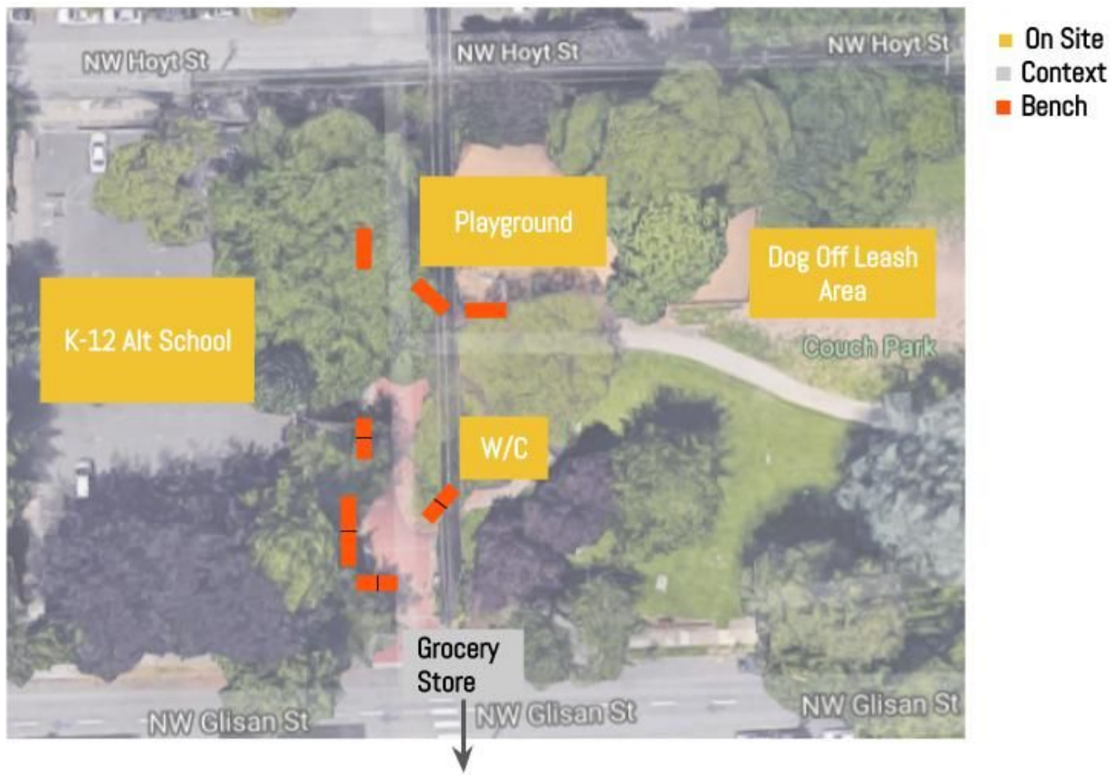
IMAGE 2. Couch Park Site Map

Couch Park is located in a high density residential and commercial mixed use zone. It is located just east of a K-12 alternative school. The park features a plaza, restrooms, playground, and a dog off-leash area. Since the park takes up two city blocks, the plaza creates a path for pedestrians to walk through the park. The seven benches that were observed are located along this path in the plaza area. Four of these benches included dividers, which are used to deter houseless from sleeping on them. The two benches closest to the playground do not have these dividers. Only one bench didn't have a back rest. The park is set to be closed and remodeled in the upcoming months.