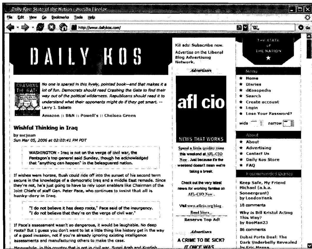
Figure 1 – Front page of the Daily Kos website.

mistaken identity, and even identity theft. As well, the inability of a user to read comments in any way but chronologically, or to reply directly to a comment that occurred earlier in the thread, hindered the interactivity of the site and the substance of the commentary. This does not mean that users did not quote other users to designate to what or to whom specifically they were replying, but the process required an extra step that not every user chose (or was technologically astute enough) to employ. It is interesting to note that this “shortcoming” remains on Eschaton, which is currently the second most trafficked comments-enabled political weblog (Sitemeter 2006).