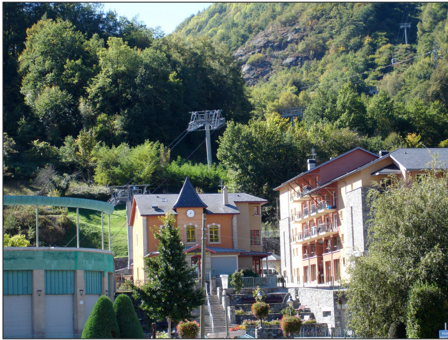
Figure 2: Ax-les-Thermes ski facilities