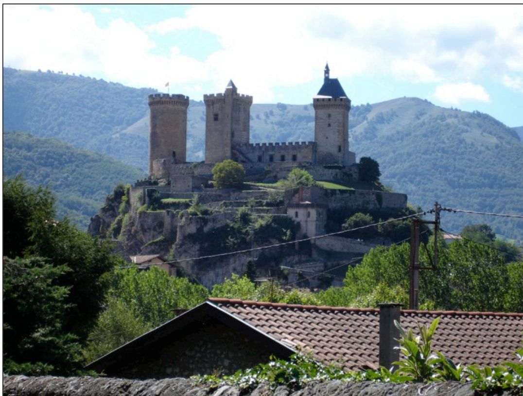
Figure 9: Castle in center of Foix

The not-quite grid frequently dead-ends upon itself, forcing backtracking, and in the dark the street layout funnels walkers away from an abrupt hill, home to the motley grouping of castle towers dominating a mound of rock at Foix's center (Figure 9).