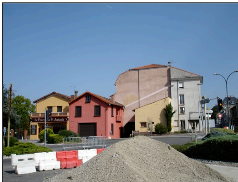
Figure 7: Construction in Pamiers

After a few minutes' walk west, past the market square, the cityscape becomes industrial. Factories, warehouses, and ironworks hug the river, reflecting local industry's origins in the Canal du Midi. Raw ore was brought down the hills of the Ariège valley and refined in Pamiers before moving farther north. The region never enjoyed a reputation for favorable refining conditions, or efficient mining practices. The outside imposition of modern refining infrastructure and expertise improved productivity in the twentieth century, but that productivity did not translate to long-term economic viability.