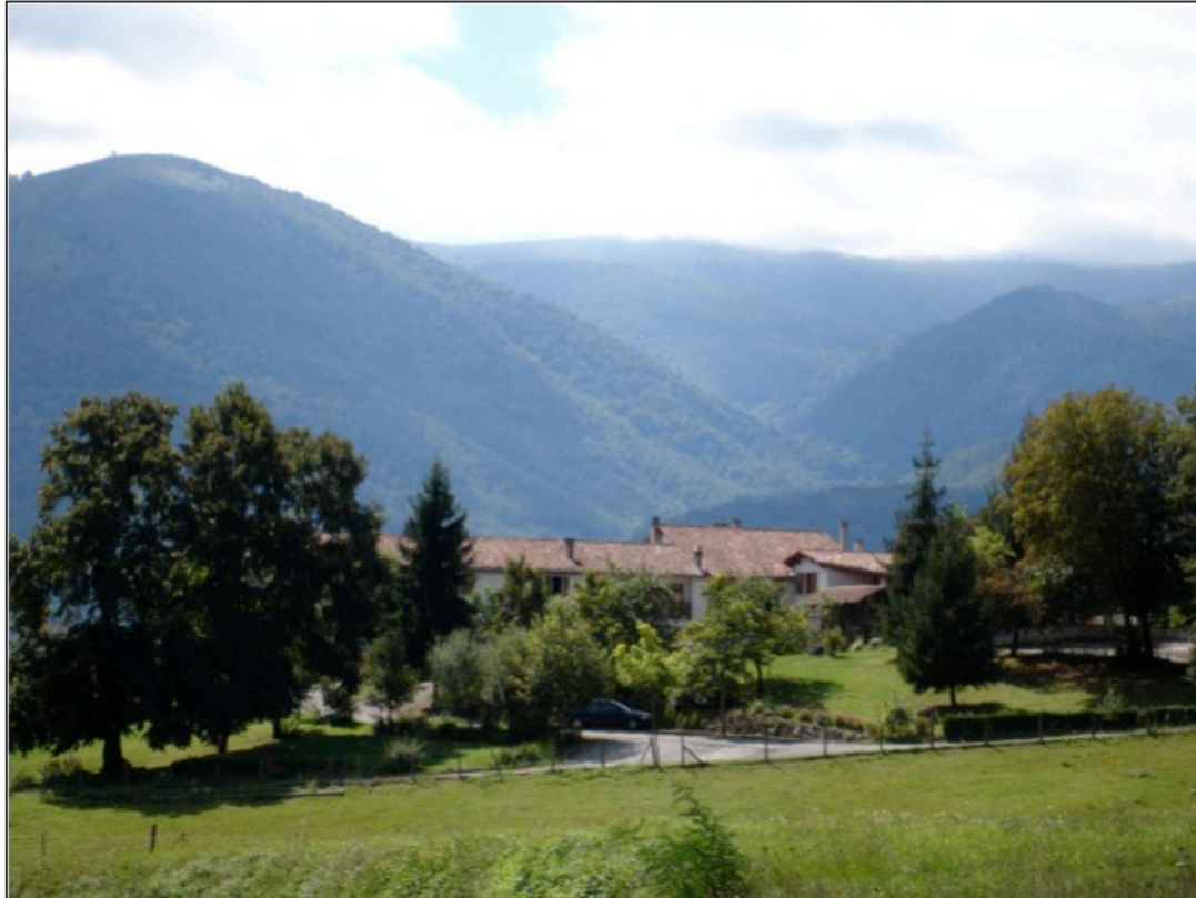
Figure 10: Farm to west of Foix

maintain the private road. The farm's income is supplemented not only by a guesthouse, but also through by-reservation prepared meals and the sale of jam.