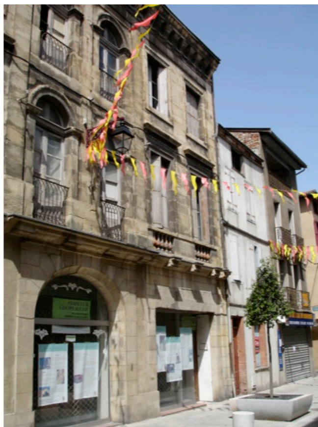
Figure 6: Pamiers commercial district

The main shopping streets, one of which is cut off to traffic for a few hours each day, are decorated with lines strung across the road, dangling triangular pendants bearing the Ariège colors. On one such street, a few blocks apart, were once a well-stocked