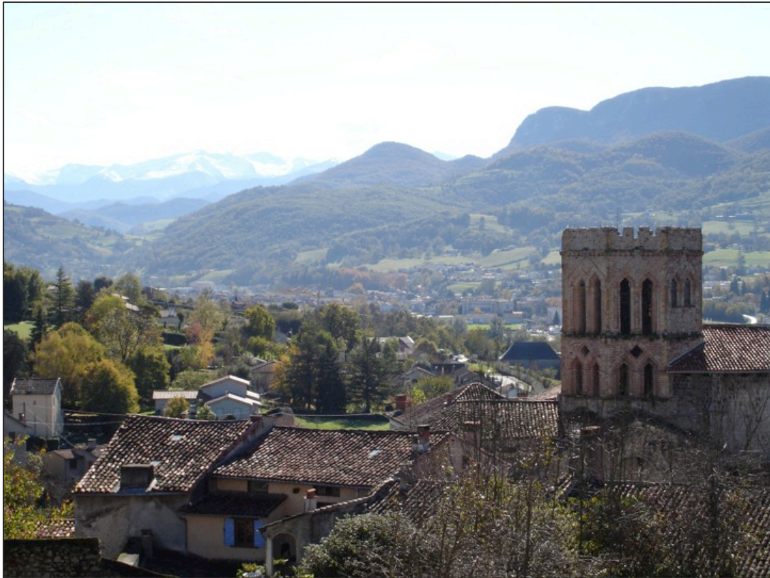
Figure 5: St. Lizier cathedral

Girons's remoteness has nonetheless made it a location accessible mainly by car. The cost of renting a car is, per week, about the same as lodging throughout Ariège, making the town effectively twice as expensive to visit as other towns.