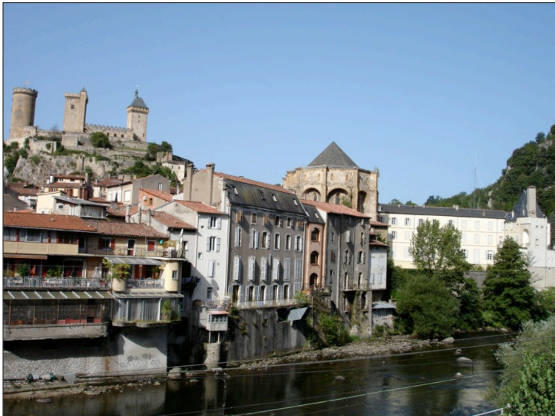
Figure 8: Eastern edge of Foix's historic core

Across the river to the west is the old town (Figure 8), winding streets bordered by medieval cross-timber buildings that open onto small squares or parks.