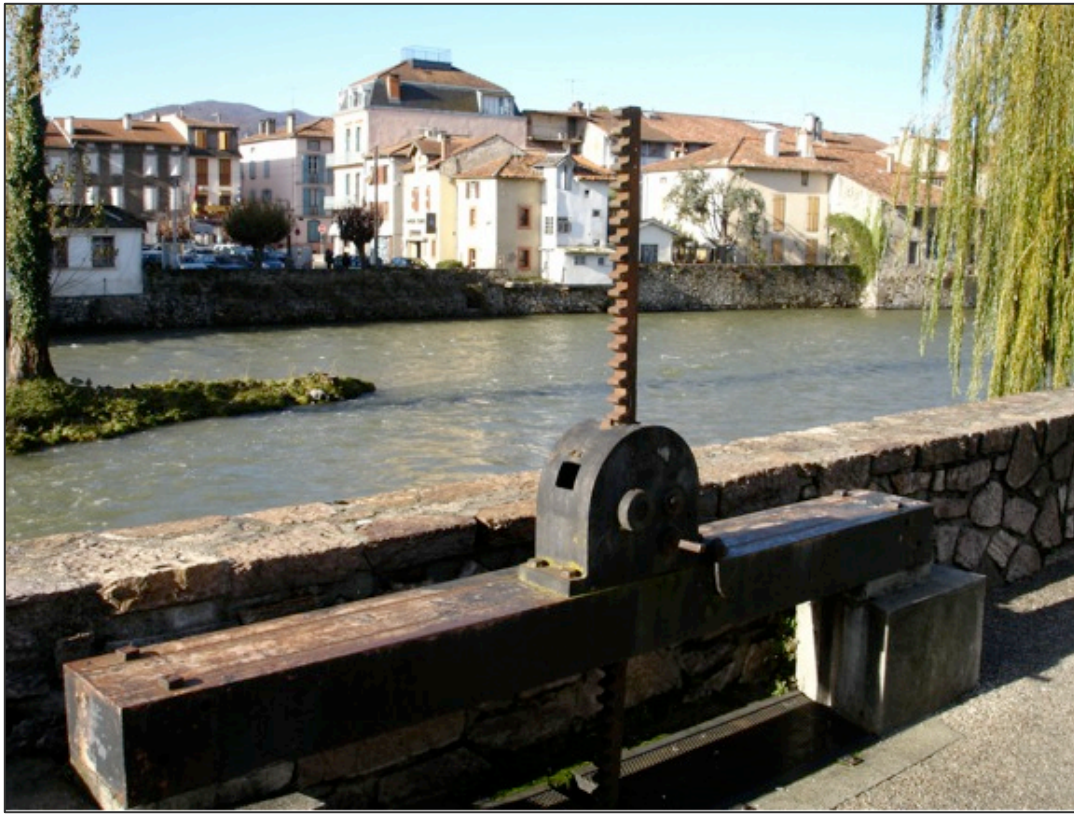
Figure 4: St. Girons drainage

The gîtes available in St. Girons and its small surrounding communes are rented at boutique rates, often paired with thermal spa therapies or organic farming courses. A high-end grocery store reflects the town's upscale ambitions, the produce combining co-op quality with a chain store's commitment to scrubbed presentation and range of choice. A bag of mushrooms is comparable in cost to a week's worth of produce at a farmers market. The town as a whole is pitched to a different market than the towns along the Ariège River, and the jump of a euro or more in the cost of goods is immediately noticeable.