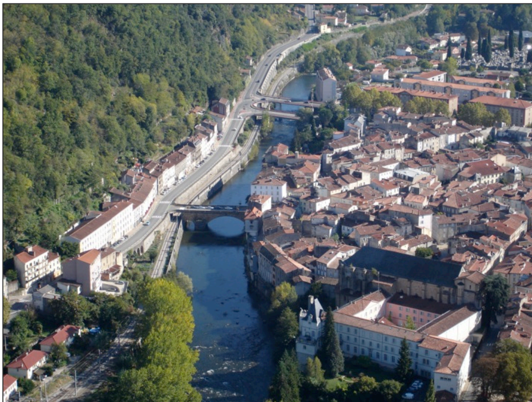
Figure 11: Foix as seen from a hill to the north

Finally, the recent recession has brought the garden vegetable plot to the city, along with new attention to and interest in food production. CAP administrators are being sent on farm work experience programs, and researchers like me are interested in better understanding how urban cores shape rural peripheries. Rather than making these landscapes exotic, the current effort is to make them familiar. I argue that in this era of growing population and resource scarcity, there is awareness that village landscapes contain a blueprint for a “technology” that could once again reshape society, and that the village might again be the frontier.