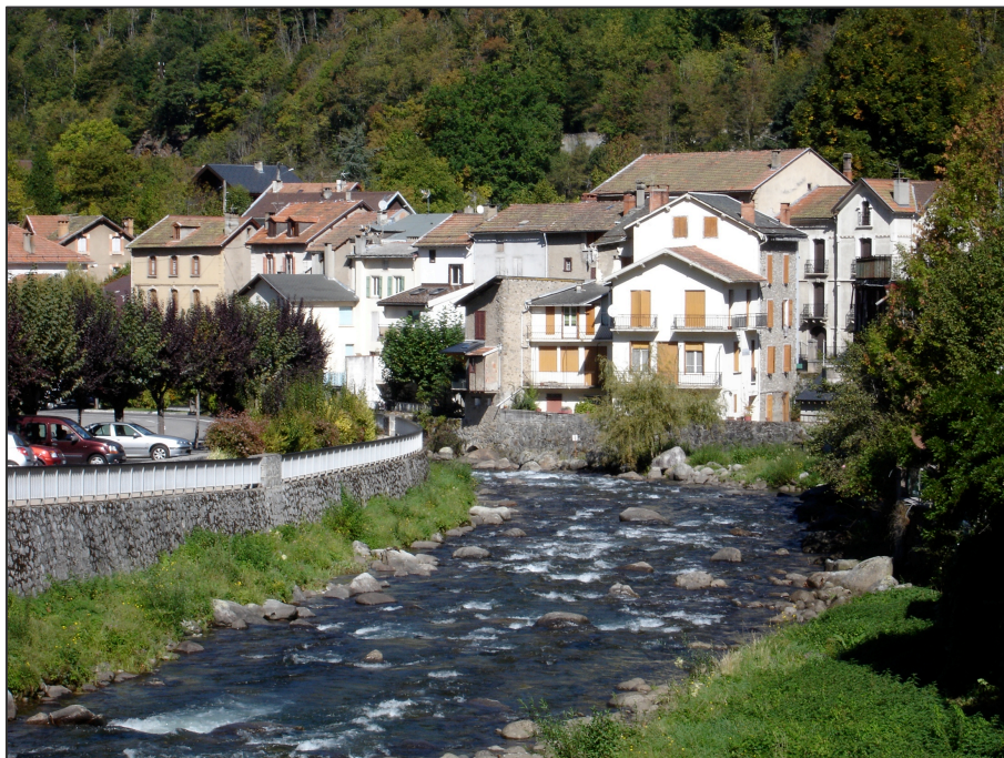
Figure 3: Outskirts of Ax-les-Thermes