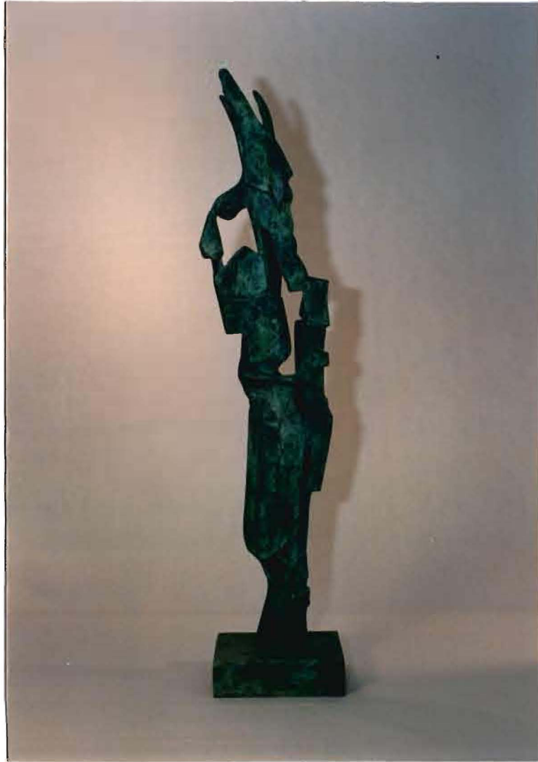
Figure 10. Ototeman, 26" high