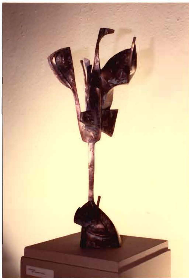
Figure 9. Hyperborean, 22" high