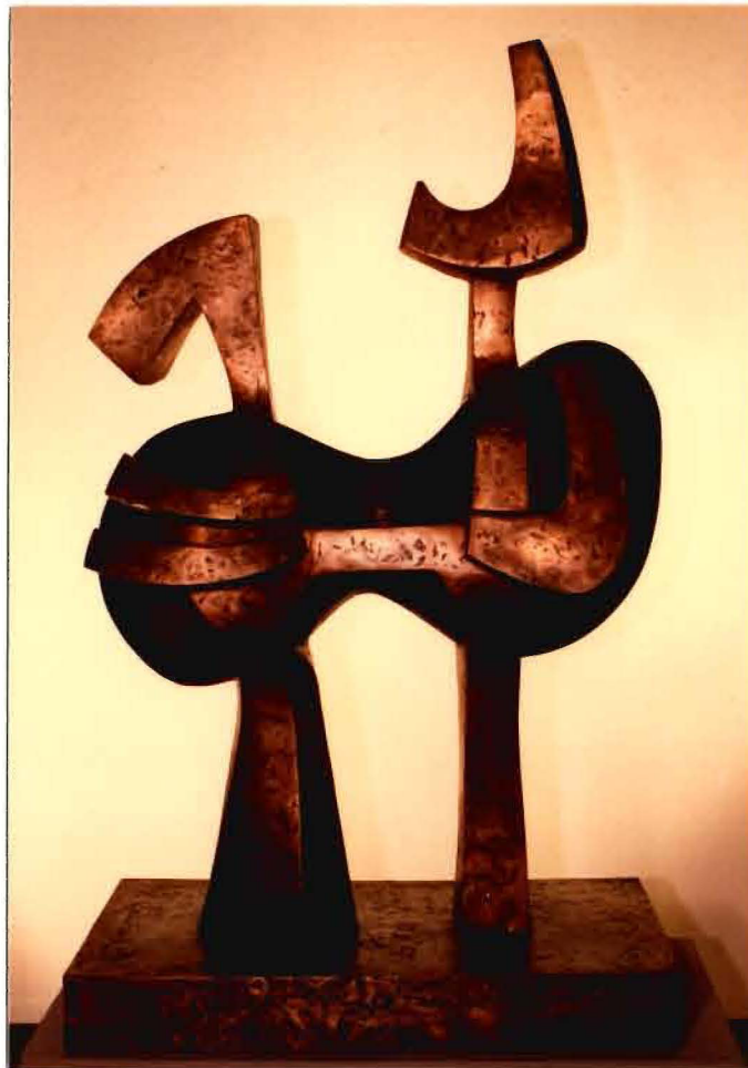
Figure 2. T.F.C., 46" high

obvious to others than myself. It provoked a range of reaction from laughter to disgust. For some it has a blatant sexual content. At first I saw it as nothing more than a depiction of male and female figures sharing a form resembling the symbol for infinity. This could be a