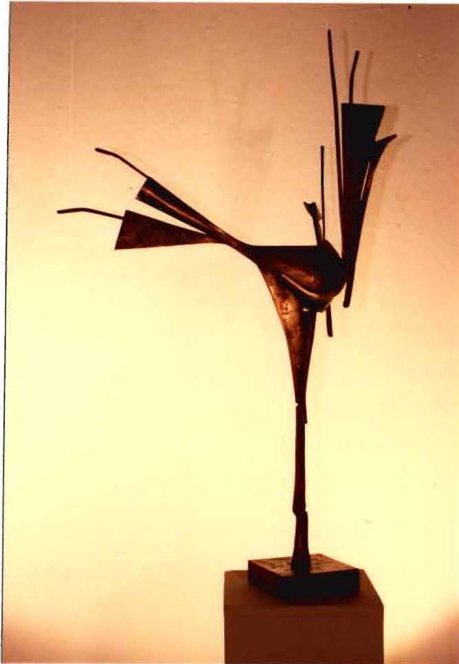
Figure 7. Tri-alars , 46" high

This was my own mental state at the time. Again the image of a bird appeared. Tri-alars is the most bird-like of all the sculptures, yet it avoids being specific.