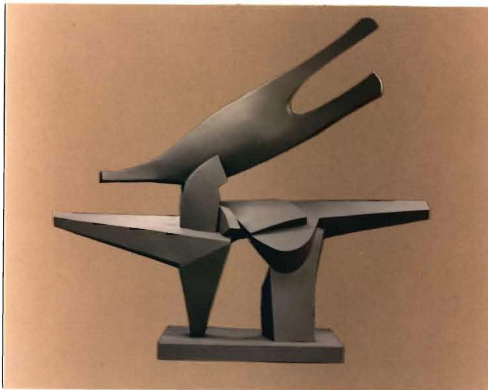
Figure 3. Orant Figure, 7' 6" high

The Orant Figure is familiar yet unlike any known entity. The basic configuration relates to the human body.