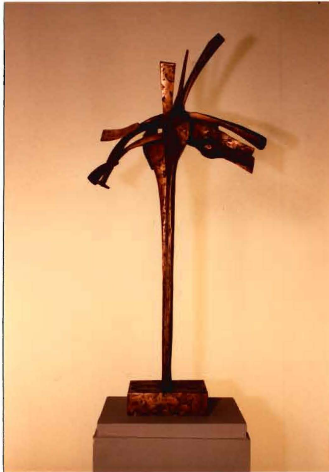
Figure 6. A Temporary Stopping Place On An Evolutionary Journey, 31" high

qualities which can be ascribed to both plants and animals. The duality of its appearance lends a humorous note to its character.