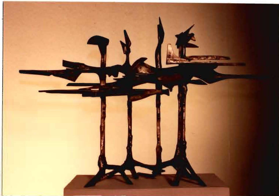
Figure 5. Tree Birds, 23" high

The message is an old one. Whatever dance we dance on earth, we do not dance alone. As individuals we are endlessly connected to society and nature. This concept does