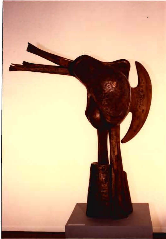
Figure 4. Strider, 48" high

Tree Birds has the feel of an ancient dance. It is an image whose source could be from collective memory. The association with plant forms is strong. The five vertical stems are connected at the base in a type of root system that becomes claw-like in some areas. Above the vertical stems is a massing of forms that appear suspended in space.