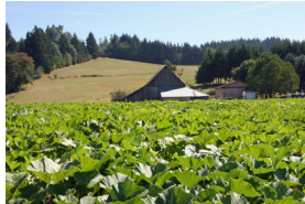
The poster photos feature production at Thompson Farms, located in Damascus.