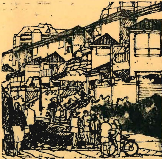
a sense of community