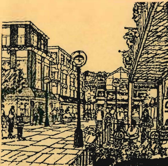
mixed land use