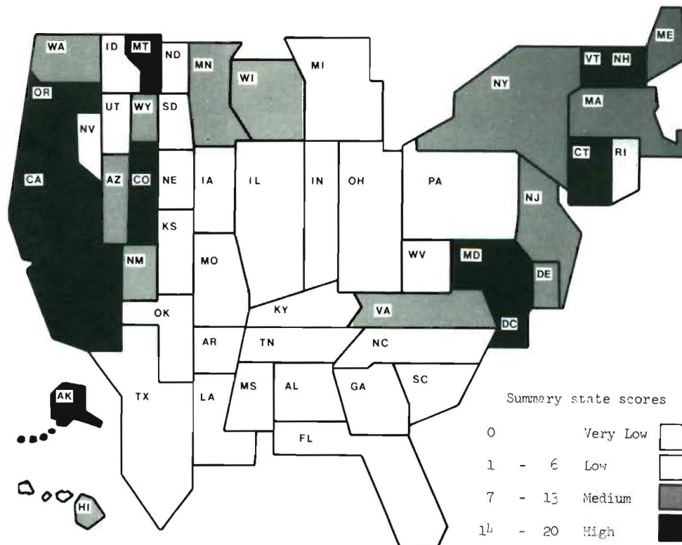
Figure 13.2 State scores on the percentage of population who were members of ten national environmental organizations in 1984. State size has been graphically distorted to reflect the relative size of its population (Ferguson, 1985, p. 90).

Looking at environmental consciousness at a more individual level, Kathy Ferguson (1986) measured environmental consciousness as it is reflected in membership rates per capita in ten environment organizations, e.g., the Wilderness Society, Defenders of Wildlife, and Environmental Defense Council. Oregon tied for third with Connecticut