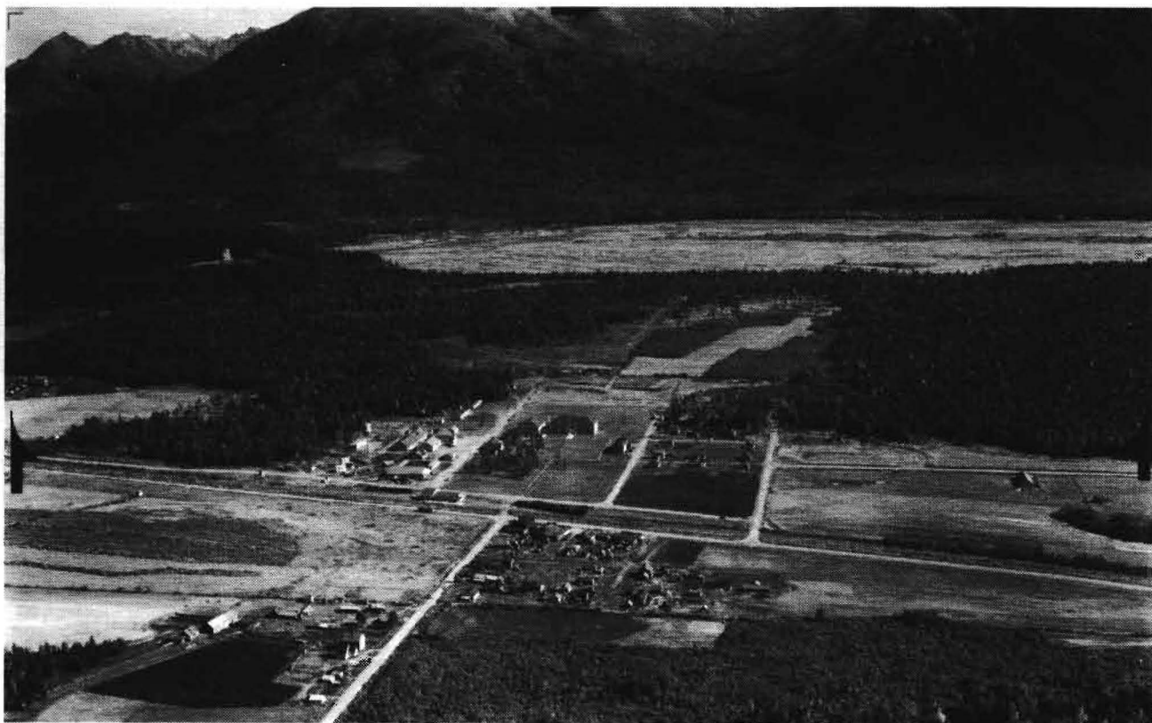
Fig. 61. Palmer, Alaska, looking east, 1939. Old Palmer is in lower center. Matanuska Colony government buildings are in the upper center. Matanuska River is in middle distance, Lazy Mountain beyond.