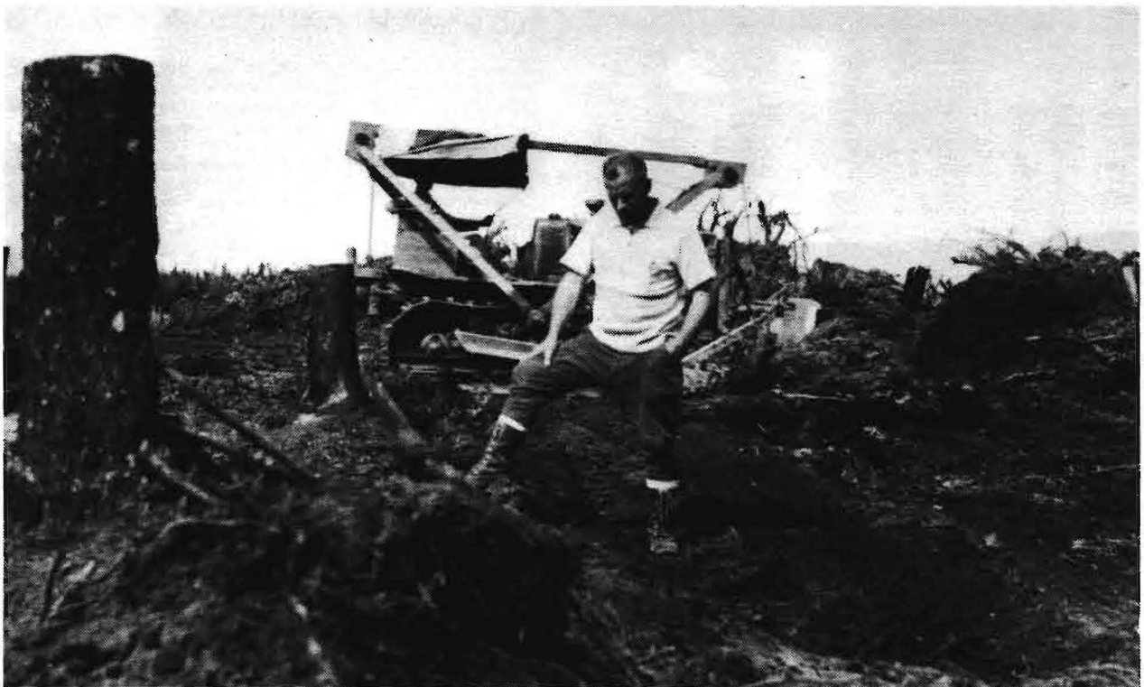
Fig. 56. W.A.R. observing results of land clearing, 3 miles south of Palmer. Stumps of birch and spruce mixture, 40-50 feet high, 6-12 inches d.b.h., slashed, logs snaked out, tops piled and burned. Very bad example of soil removal in land clearing, 5-6 inches of vegetative layer and mineral soil is being removed with stumps. Total depth of soil is about 24 inches.

During the summer I worked closely with Don Irwin and Ross L. Sheely, General Manager of the Alaska Rural Rehabilitation Corporation, Matanuska Valley Colonization Project, as well as many of the