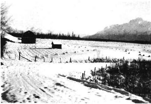
Fig. 63. Matanuska Valley, October 12, 1939, looking southeast, showing a large haybarn of the homesteader still unfilled. The snow-covered hay was intended for the barn. Pioneer Peak on the right.