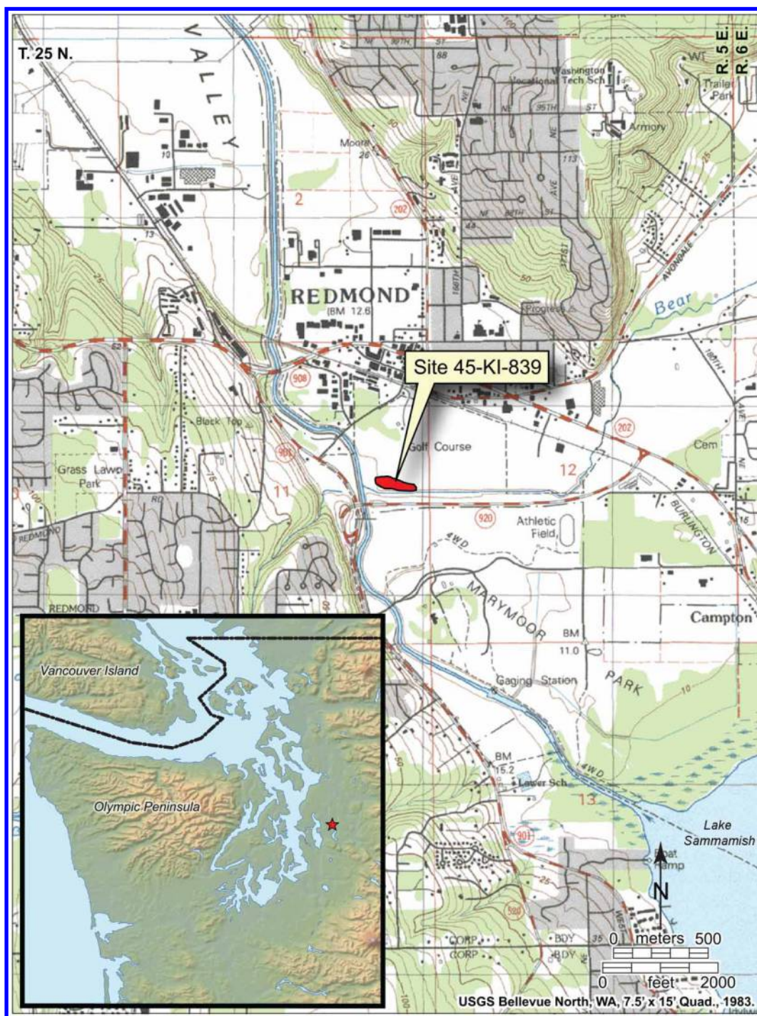
Figure 1 Location of the Bear Creek site (45KI839) near the north shore of Lake Sammamish, Puget Lowland, Washington.

or shorter-term environmental changes, particularly in Stratum V, which includes the in situ artifact-bearing Stratum Vc. The current radiocarbon sequence is based on 12 samples taken during the 2008 and 2009 investigations (Table 1). Most of these samples are within Stratum Vb, providing upper limiting dates on the in situ assemblage. One fragment of detrital charcoal obtained from Stratum Vc sediments, the in situ artifact-bearing deposit, yielded a date of 10,780 \pm 60 ^{14}\text{C} yr BP. Additional dating of this stratum is underway and will hopefully shed light on local site formation processes as well as the