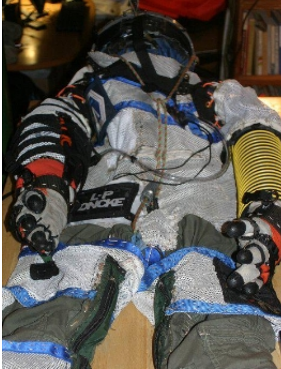
FIGURE 1. Pacific Spaceflight Model II/III Pressure Garment (Left) with lightweight, slim convolute elbow section installed on suit's L arm and older section on suit's R arm. Right photo shows suited person installed in Kazbek trainer.