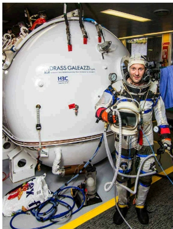
FIGURE 1. (A) Test Subject Standing Before the Trykkammer Wearing the Mark I ( Gagarin ) Pressure Garment. The flight coverall was not worn in this test; visible is the pressure restraint garment that covers the gas retention layer. (B) Test Subject (L) and Pressure Garment Operator (R) During Depressurization Test.